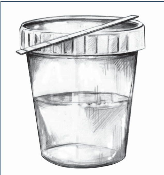
A strip of chemically treated paper will change color when dipped in urine with too much protein.

In some cases, the doctor may want to examine a small piece of kidney tissue with a microscope to see if something specific is causing the syndrome. The procedure of collecting a small tissue sample from the kidney is called a biopsy, and it is usually performed with a long needle passed through the skin. The child will be awake during the procedure and receive calming drugs and a local painkiller at the site of the needle entry. A child who is prone to bleeding problems may require open surgery for the biopsy. General anesthesia will be used if surgery is required. For any biopsy procedure, the child will stay overnight in the hospital to rest and allow the health care team to address quickly any problems that might occur.